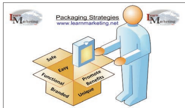
Fig. 2. The six functions of the packaging process [8]

The “packaging” strategy in the field is an important side for the sustainability of the producers and influences both the corporate objectives, the individual objectives of the departments, as well as the general objectives of the industry to which the respective producer belongs (figure 1).