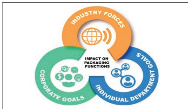
Fig. 1. The strategy of packaging [7]